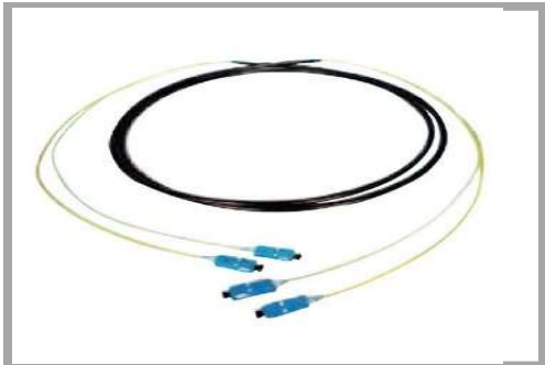
Target : DLC connector type

Water proof. Pre Oil Abrasion Resistance Pre. OIL Flame retardant (JIS 3005) Use of inside & outside Temperture range -30~70℃ Diameter 6.2mm Inside&outside 2芯 · GI · OM2 · 50/125 · 5G Cord color wakakusa:LG-: murasaki : Prple